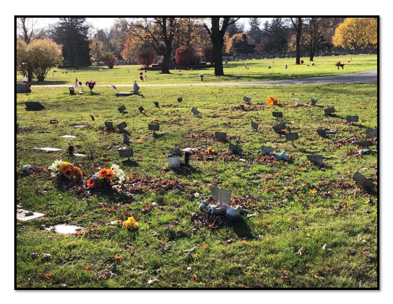
More Temporary Markers

The project was formally begun in the spring of 2021. The first phase of the project was to create and initiate a fund-raising drive for the entire cemetery highlighting the priority of Babyland. The mailing resulted in raising $45,000, of which $15,000 was specified by some donors for the Babyland project. We were overwhelmed and grateful, praising God's blessings!